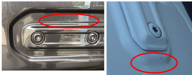
Fig. 4 Examples Of Corrosion At Or On Hinges