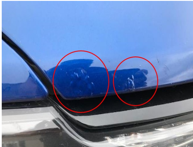
Fig. 3 Example Of Corrosion Along Leading Edge