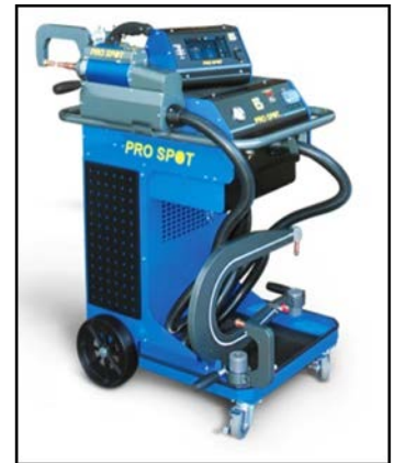
ProSpot i5 SMART Spot Welder