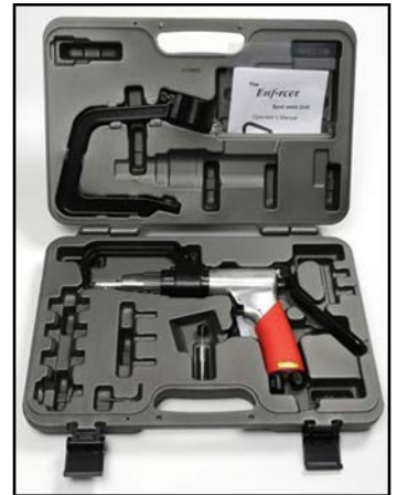
Blair Enforcer™ Spot Weld Drill Kit