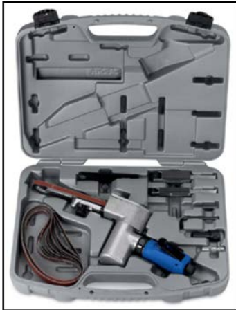
Blue-Point® AT615 Belt Sander Kit