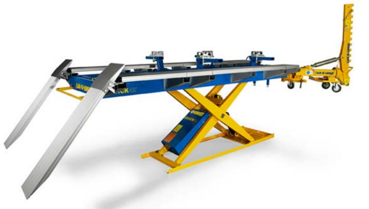
Car-O-Liner Benches and Measuring Systems