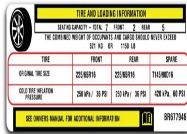
Fig. 1 Tire Label

For more information, visit www.escvin.com or call 1-855-ECSVIN ** (U.S. dealers) or 1-636-536-2221 (Canadian dealers) ** .