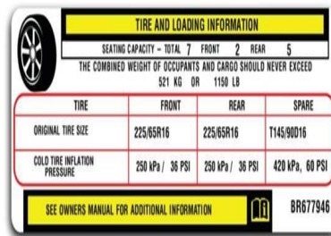
Fig. 1 Tire Label