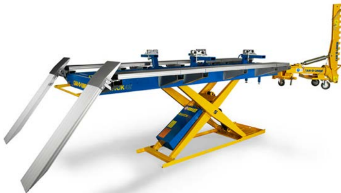
Car-O-Liner Benches and Measuring Systems