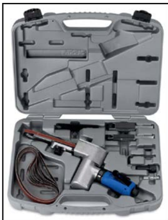
Blue-Point® AT615 Belt Sander Kit