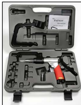
Blair Enforcer™ Spot Weld Drill Kit